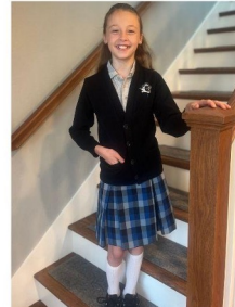
PLAID SKIRT (G3-8 GIRLS); LOGO POLO SHIRT TUCKED IN; NAVY LOGO CARDIGAN