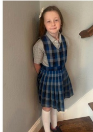
PLAID JUMPER (TK-3 GIRLS); LOGO POLO SHIRT

P.E. Uniforms are NOT allowed on VIP Day or Bishop's visits.