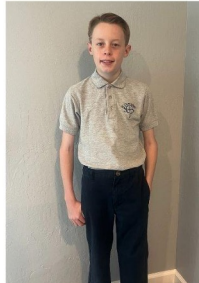
LONG NAVY PANTS; LOGO POLO SHIRT TUCKED IN